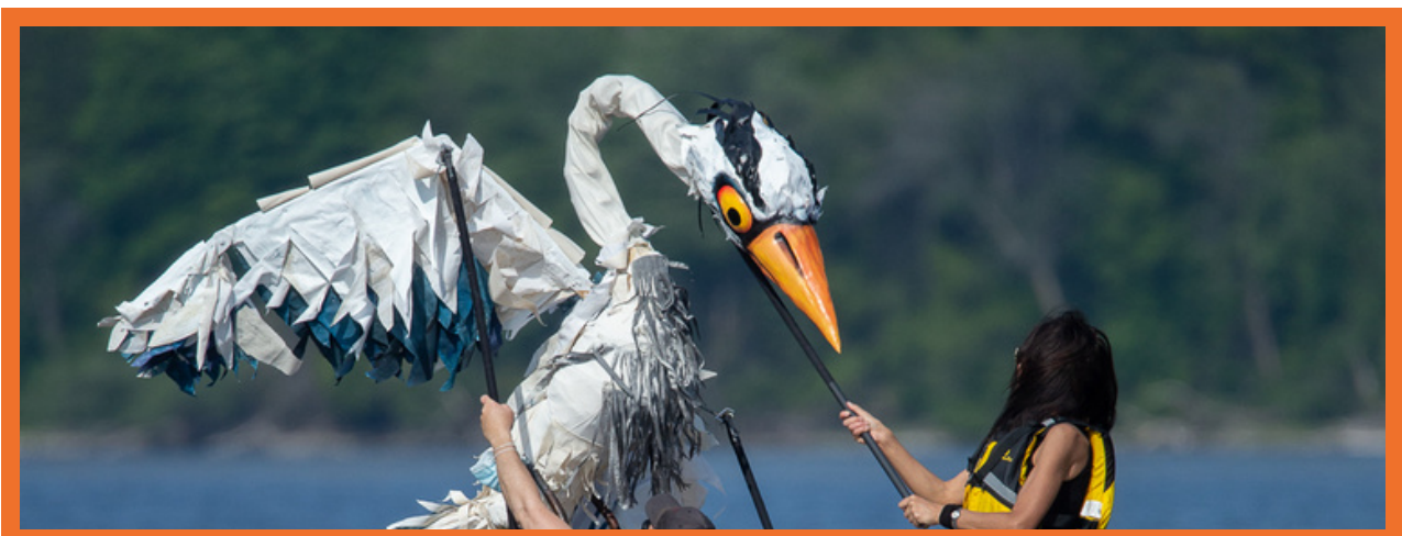
Calliope Collective, HYDRA (2020 Project Grant), submitted photo of Heron puppet by Clelia Scala.

ARTS ORGANIZATIONS SUPPORTED WITH OPERATIONAL FUNDING